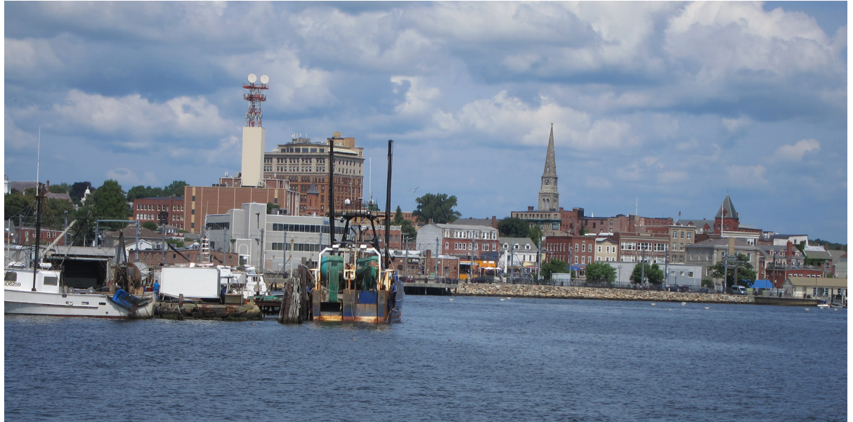
New London, Connecticut.

How Coastal New England Cities Are Harnessing the Power of the Emerging Offshore Wind Industry to Promote Local Economic Development