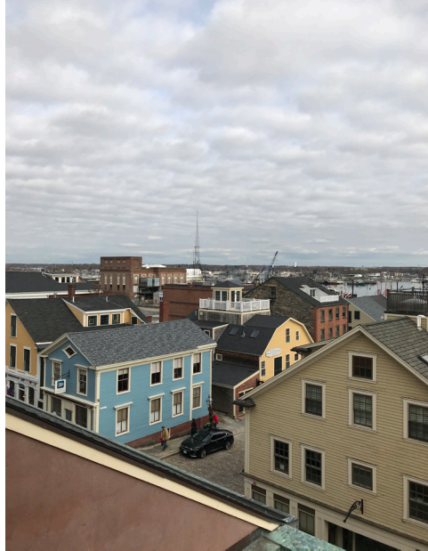
New Bedford, Massachusetts.

The city’s waterfront and port infrastructure are perhaps its greatest economic assets, and New Bedford has initiated a robust planning effort to put the area to its best use. Offshore wind is a component of that, but additional historical, cultural and economic resources play a role as well. The city’s vision is encapsulated in the New Bedford Waterfront Framework Plan, a comprehensive document that suggests a variety of land use changes, new development, and connectivity improvements to knit the waterfront into a cohesive city hub. The guiding principles of the plan include: