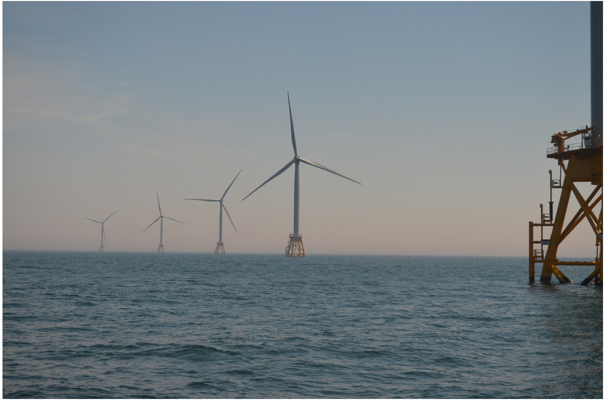
Block Island Wind Farm.

How Coastal New England Cities Are Harnessing the Power of the Emerging Offshore Wind Industry to Promote Local Economic Development